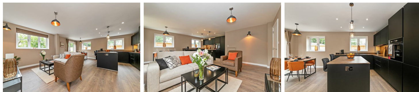
Ground Floor Approx. 433.7 sq. feet

Plot 4 - Measuring approximately 852.6sq ft - Accommodation briefly comprises of an entrance hall, open plan living/kitchen/dining room, utility room, cloakroom, two double bedrooms, e-suite to bedroom one and a family bathroom.